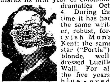
Lucille Ball ... in the mood during a broadcast